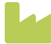
Production and manufacturing