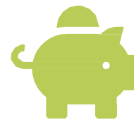
Banks, financial institutions and insurance