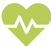
Education and health