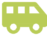
Transportation and communications