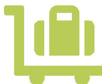
Hospitality, tourism and entertainment