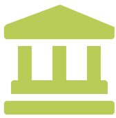
Real estate and construction

The scope of business solutions provided by TPC Group extends across multiple sectors. Our experience in specific industry markets allows us to offer customized solutions for each client.