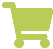
Trade and commerce