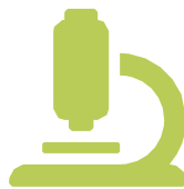
Technology, research and development