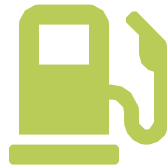
Hydrocarbons and electricity