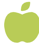
Agriculture, livestock and related industries